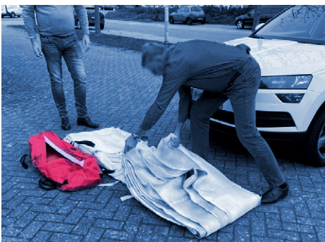
Take the blanket out of the smart bag