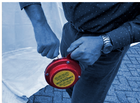
Take an aerosol unit