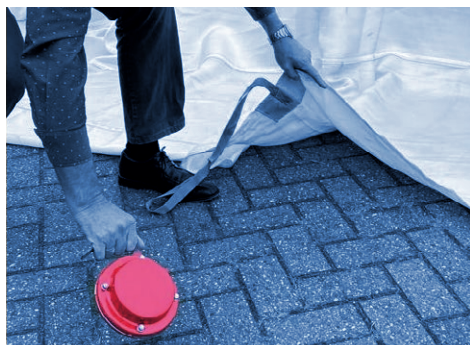
Place/throw the aerosol unit under the car/blanket, as close to the battery as possible