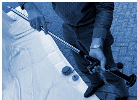
Assemble the water mist lance