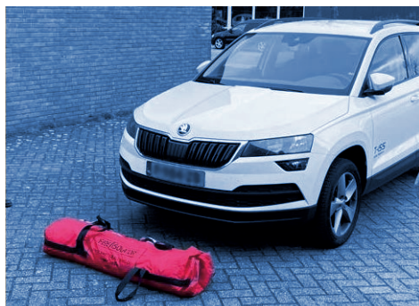
Place the Fire Isolator FI-BL0906 blanket in front of the car