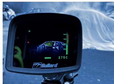
Monitor the temperature development of the fire using a thermal camera