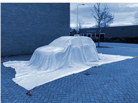
Straighten the blanket to make sure the blanket touches the ground around the car