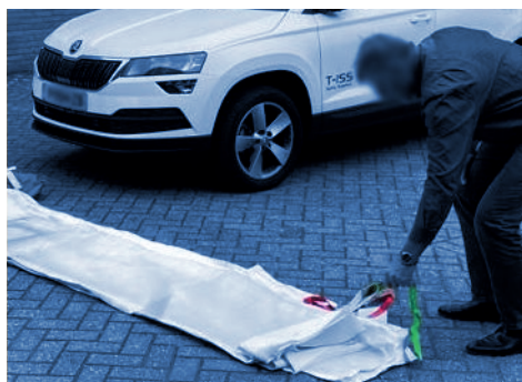
Pull half the blanket over half the car using the (green) loops