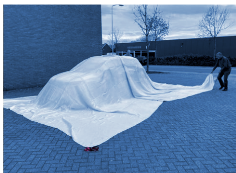
The car is now fully covered