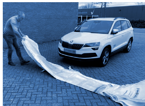
Unfold the blanket to its full width