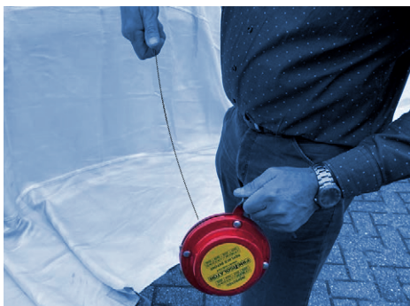
Activate the aerosol unit by pulling out the cord