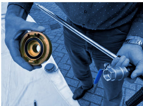
Ensure the correct fire hose connection