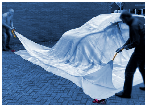
Now pull the other half of the blanket over the car using the yellow loops